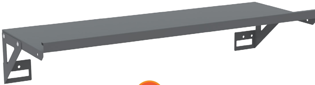
"Bracket Down" Top Shelf Option