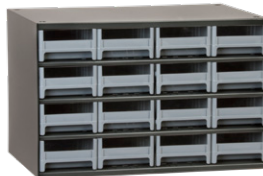
19416 – 16 Drawers