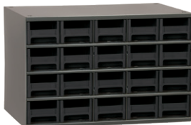
19320 – 20 Drawers