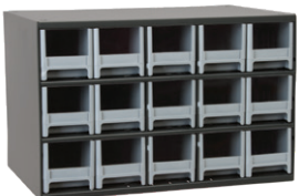
19715 – 15 Drawers