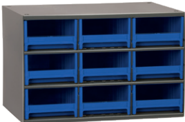
19909 – 9 Drawers