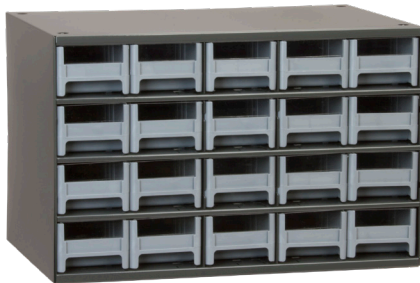
19-Series Steel Cabinet 20 Drawers

Explore a wide variety of customizable configurations to suit your needs.