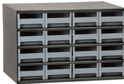
19-Series Steel Cabinet 16 Drawers