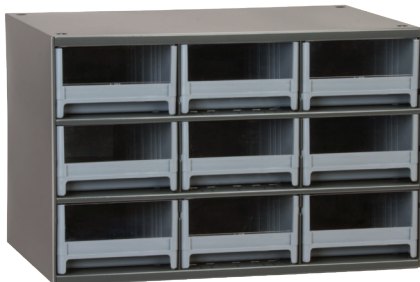
19-Series Steel Cabinet 9 Drawers