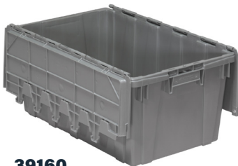
39160 2.25 ft 3 , 100 lbs. Capacity