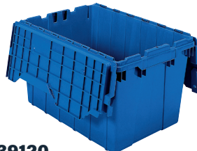
39120 1.62 ft 3 , 65 lbs. Capacity