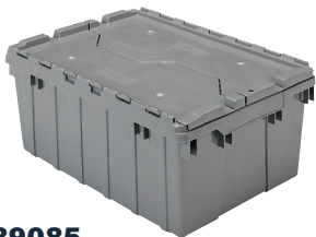
39085 1.12 ft 3 , 35 lbs. Capacity

Explore a wide range of sizes and designs to meet your distribution and storage needs.