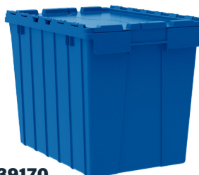
39170 2.28 ft 3 , 100 lbs. Capacity