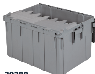
39280 3.82 ft 3 , 100 lbs. Capacity