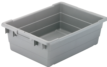
34303 Cross-Stack 9.81 Gallon Akro-Tub