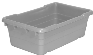
34305 Cross-Stack 9.75 Gallon Akro-Tub