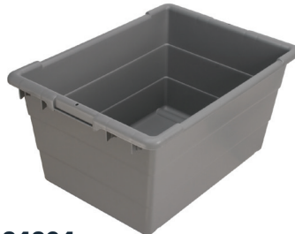
34304 Cross-Stack 14.38 Gallon Akro-Tub