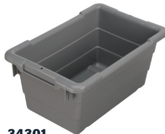
34301 Cross-Stack 3.85 Gallon Akro-Tub