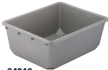
34240 Standard 14.6 Gallon Akro-Tub

Ideal for the food service industry and various industrial applications— Akro-Tubs are available in a wide range of sizes and capacities.