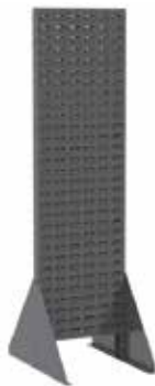
Double-Sided Rivet Floor Rack