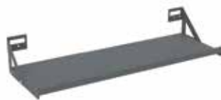
AkroShelf® (use with or without a louvered panel)