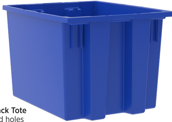
Nest & Stack Tote Pre-drilled holes

Choose from 3 Colors See below for available sizes