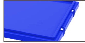
Security Lid Pre-drilled holes