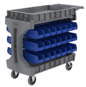
Large ProCart 9-Rail System

Wall-Mounted Steel Rail for Hanging Bins